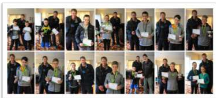
Winners of the Junior Club Champs 2016-17